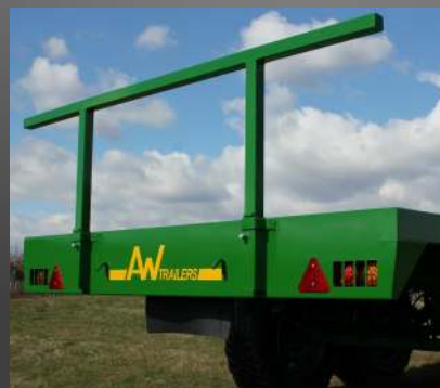
Goalpost rear bale ladder