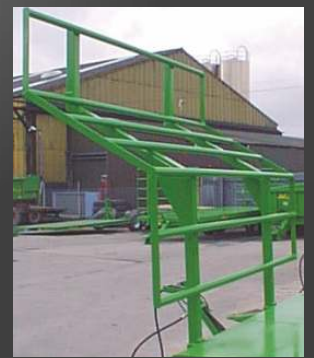
Cranked rear bale ladder

AW Engineering (Hereford) Ltd. Stoney Street, Madley, Hereford, HR2 0AR