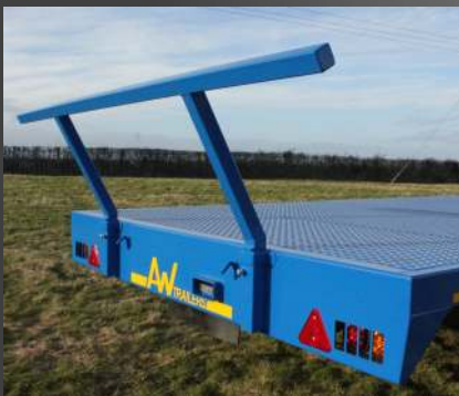
Cranked goalpost rear bale ladder